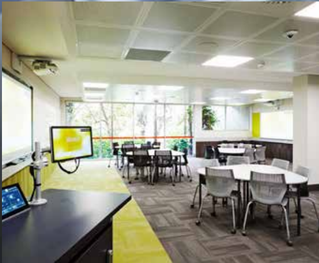
CURTIN UNIVERSITY, CANBERRA

At Pacific Datacom we work in partnership with our customers to ensure that we provide the best product solution, ensure smooth delivery, meet critical deadlines and stay within your budget. Our highly trained and expert staff can help you solve any problems along the way and come up with solutions to meet your changing needs over the length of your project. Here are some examples of our work