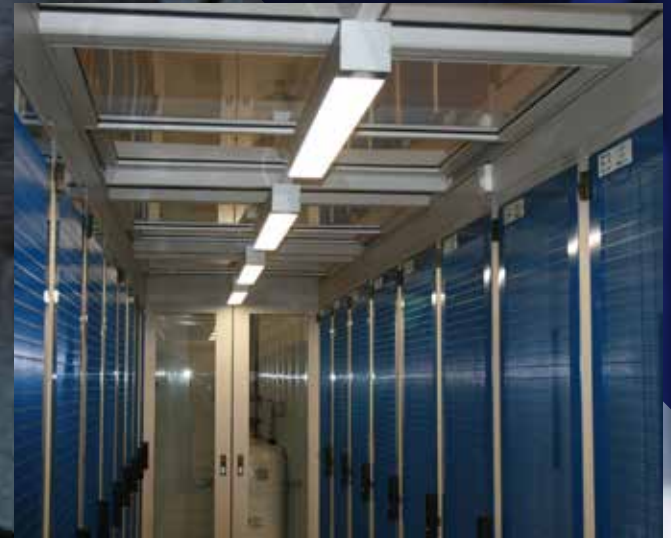
TATTS GROUP, BRISBANE